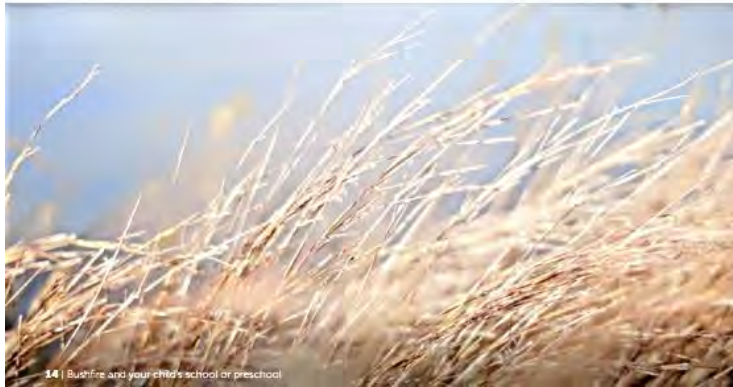
14 | Bushfire and your child's school or preschool