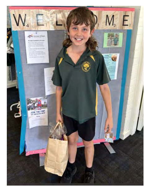
One happy 2<sup>nd</sup> place winner!

A big thank you to all of our Light Pass community for all your donations and for buying lots of raffle tickets! It was a very successful fundraiser. Also a HUGE thank you to Carla for all her hard work getting the raffle tickets ready and putting together the baskets. We are very grateful ©